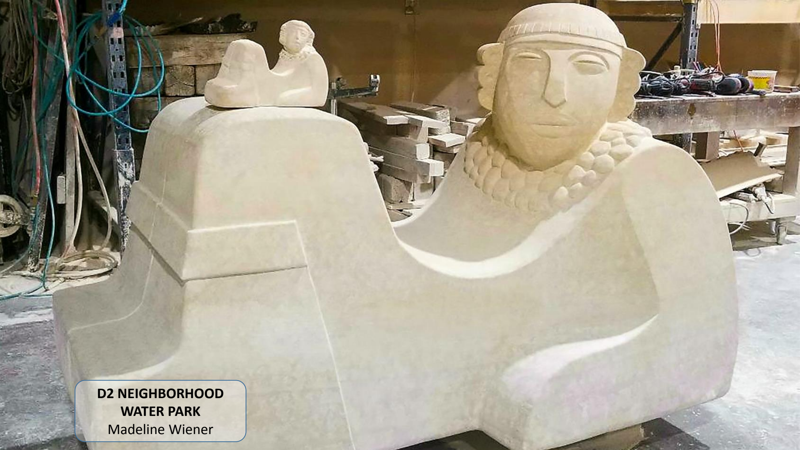
D2 NEIGHBORHOOD WATER PARK Madeline Wiener