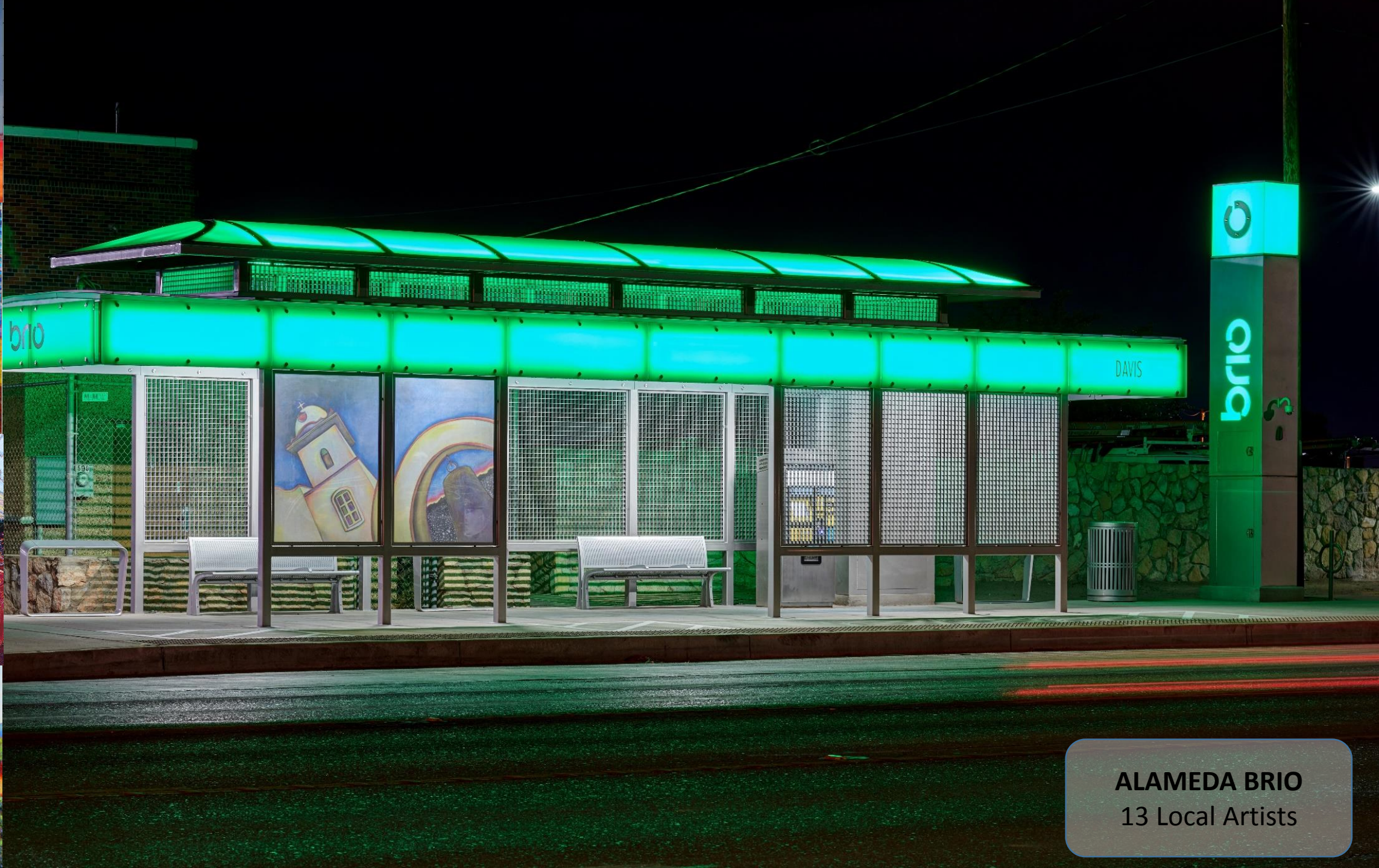
ALAMEDA BRIO 13 Local Artists