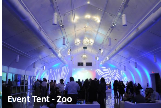
Event Tent - Zoo