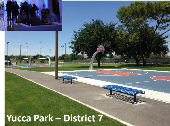
Yucca Park – District 7