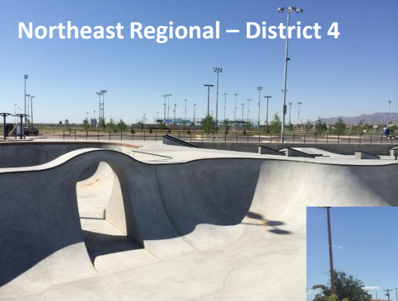
Northeast Regional – District 4