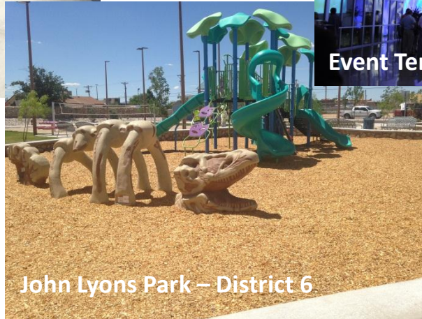
John Lyons Park – District 6