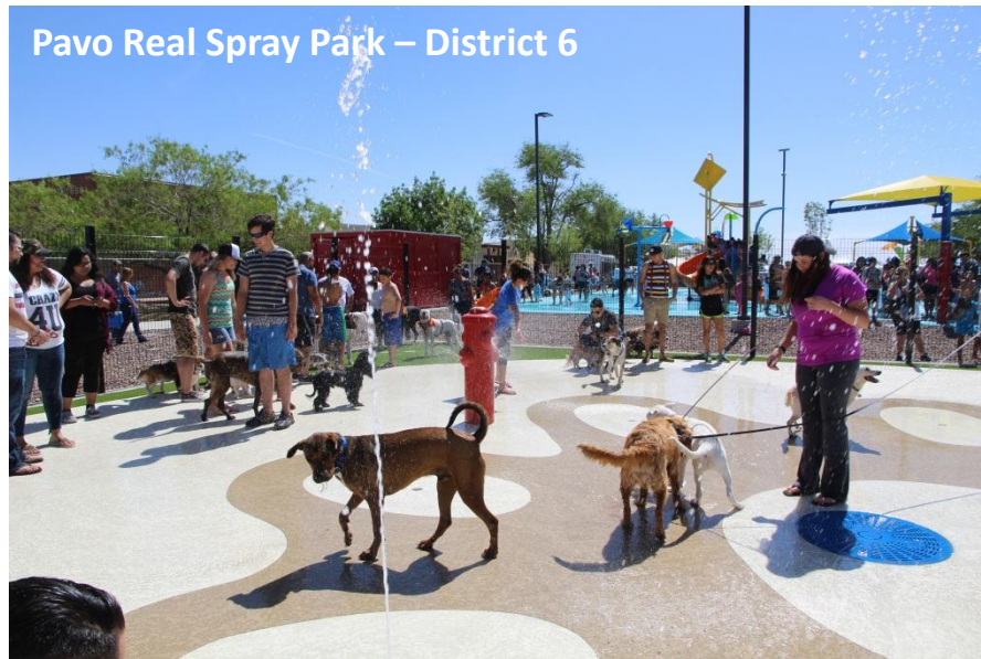
Pavo Real Spray Park – District 6