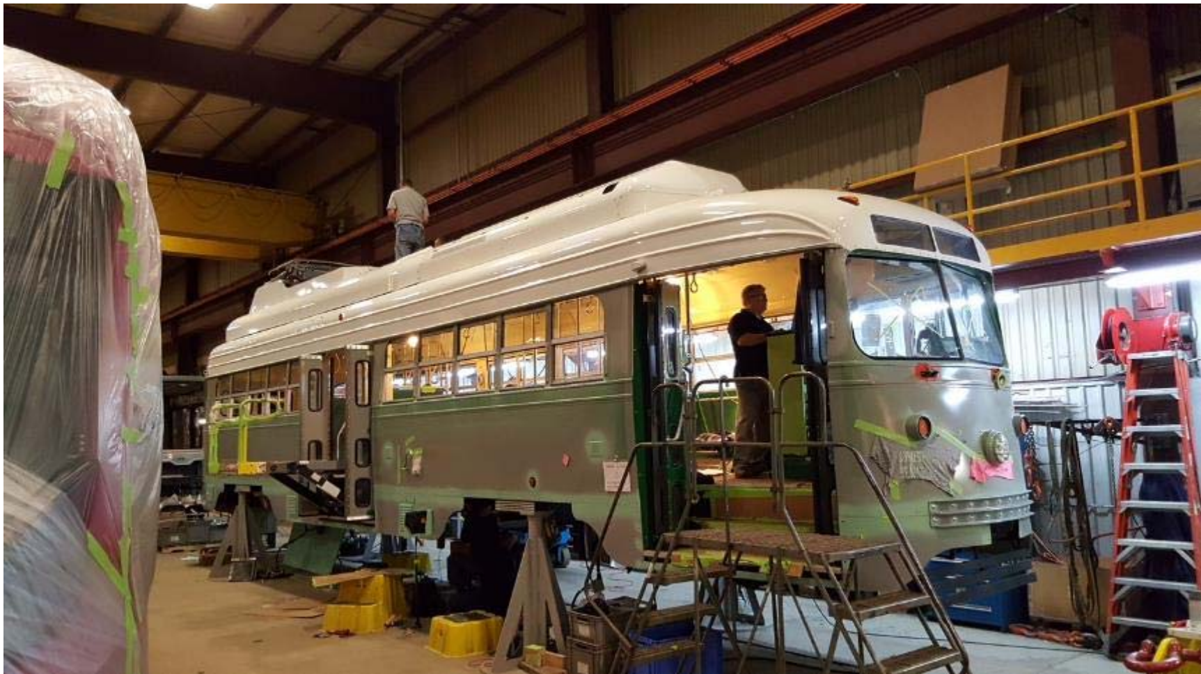
1 st PCC car receiving finishing treatments – 12 JAN 2018