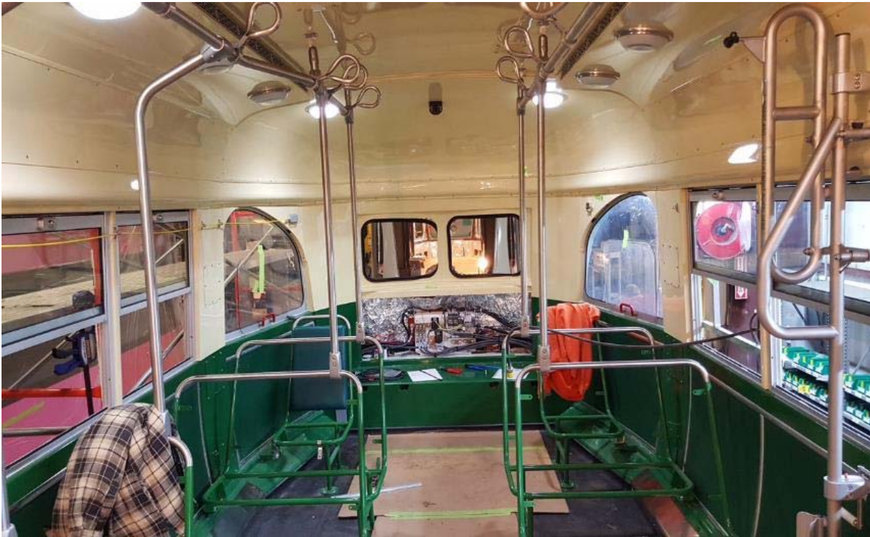
1 st PCC streetcar receiving seat frame installation – 12 JAN 2018