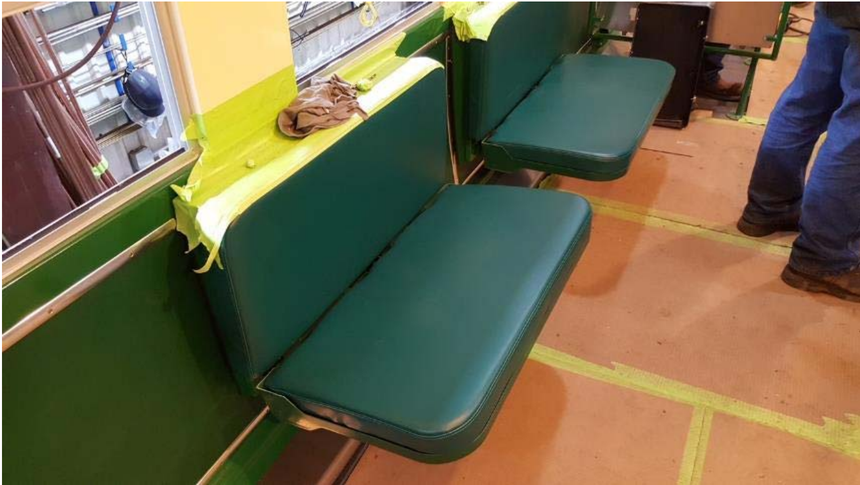
1 st PCC streetcar with completed flip-up seats in ADA W/C loading area - 12 JAN 2018