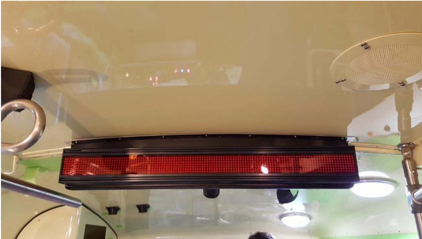
1 st PCC streetcar with LED electronic destination sign installed – 14 JAN 2018