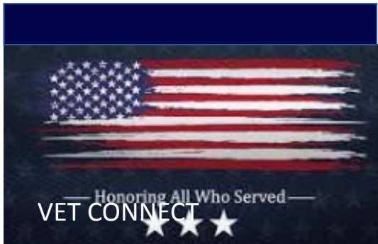
A monthly/Quarterly snapshot of veterans in our city