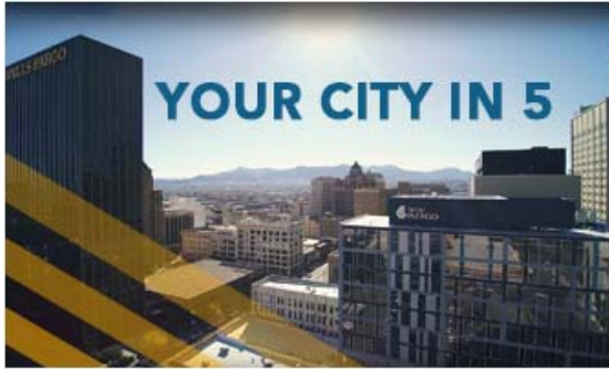
A weekly snapshot of your City government and City Events.