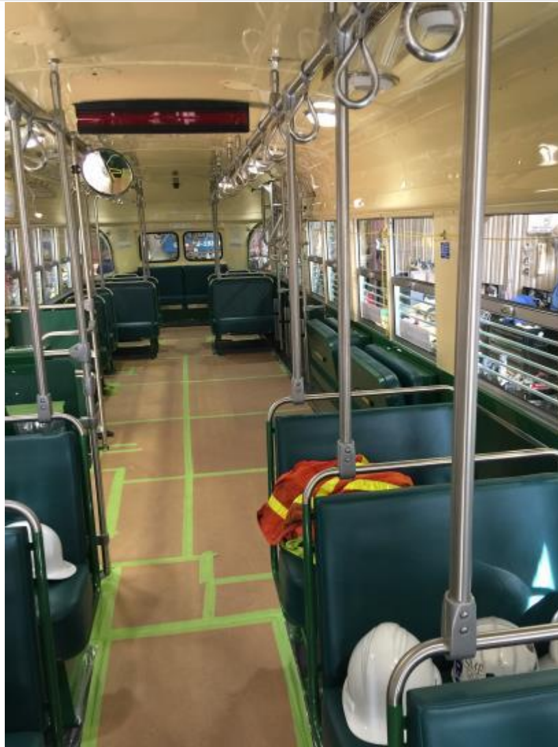
Car# 1506 – completed interior showing flip-up seats in ADA W/C loading area and LED Stop Request Annunciator - 31 JAN 2018