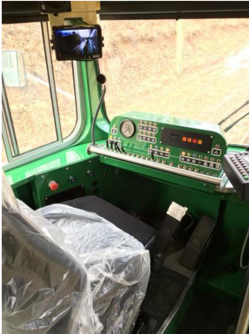
Car# 1506 operator's position showing instrumentation – 31 JAN 2018