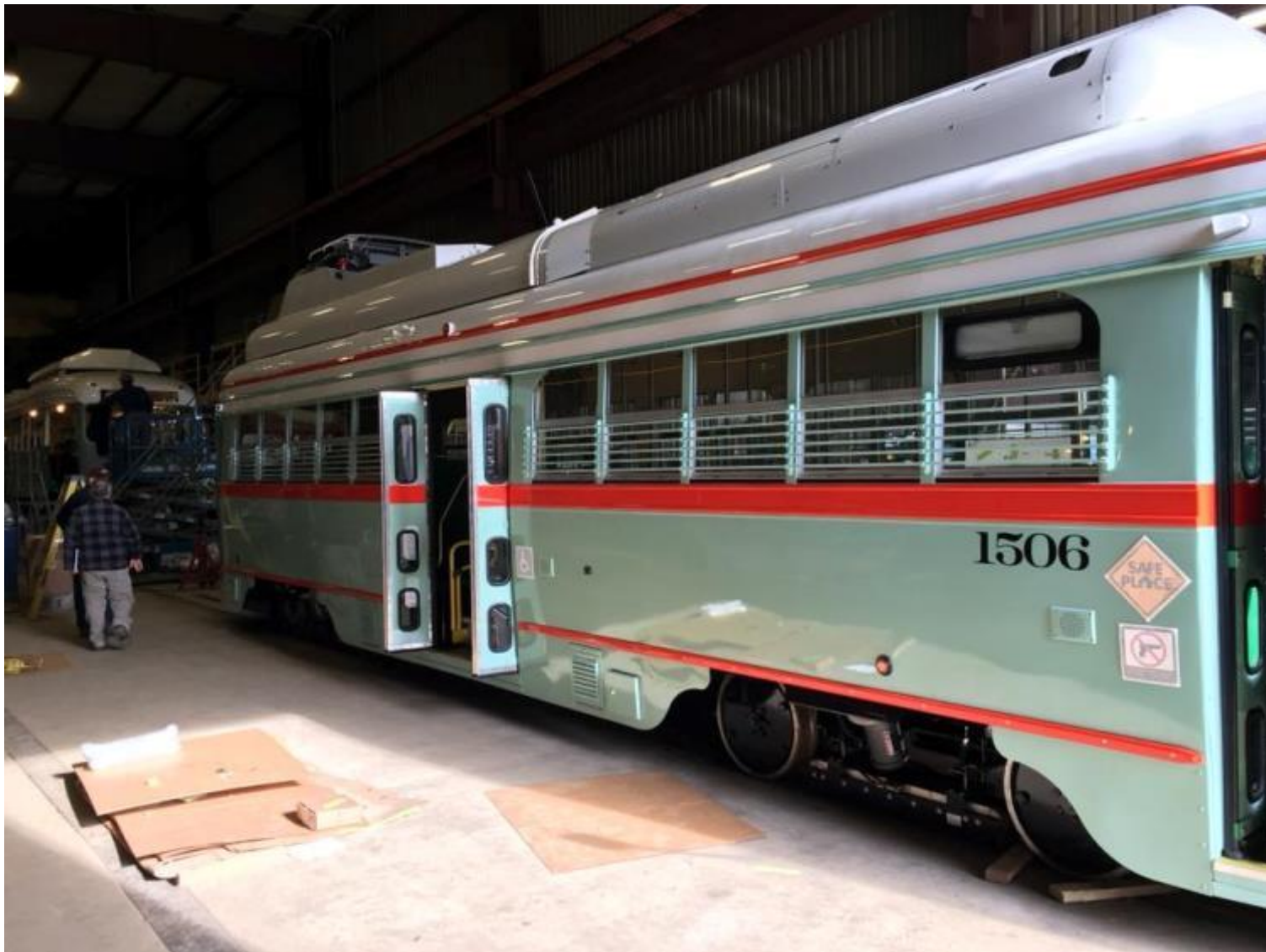
Side view of car# 1506 testing decal treatments – 31 JAN 2018