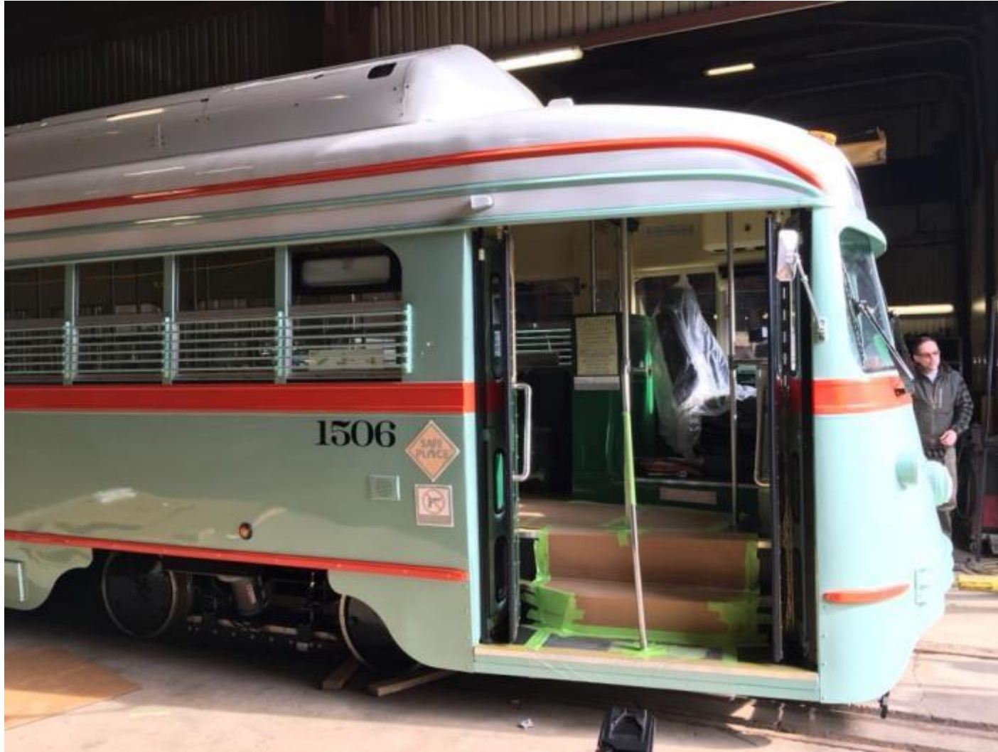
Car# 1506 – front passenger entry showing external CCTV camera, side-mount mirrors and door handles – 31 JAN 2018