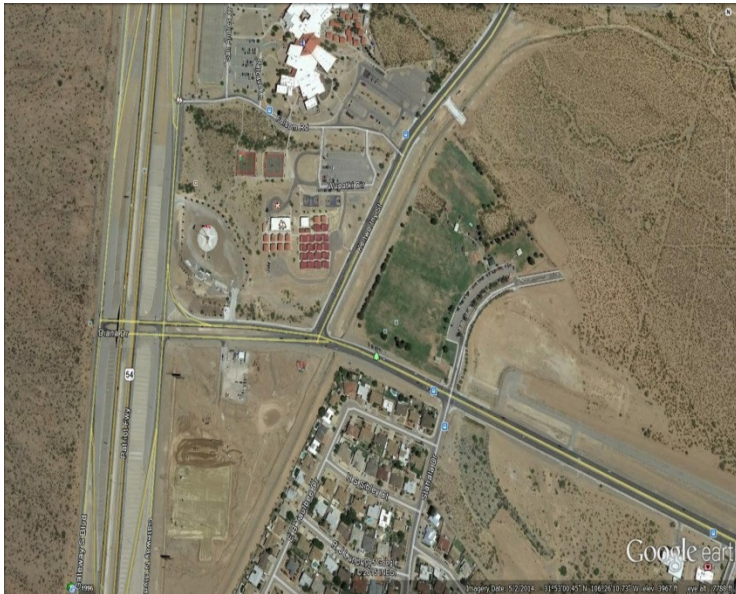
Diana Dr. and Stahala Dr.