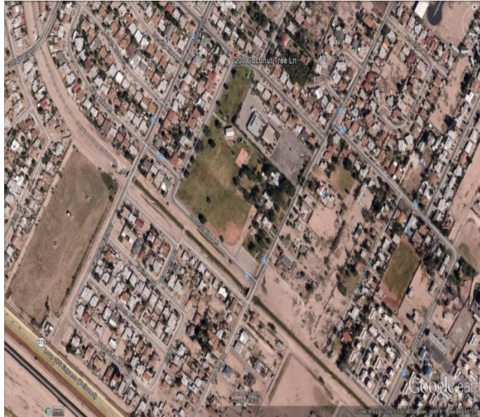
Coconut Tree Ln. and Granite Rd.