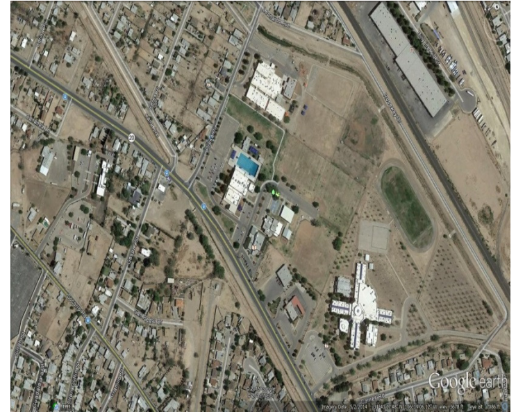
Alameda Ave. and Presa Pl.