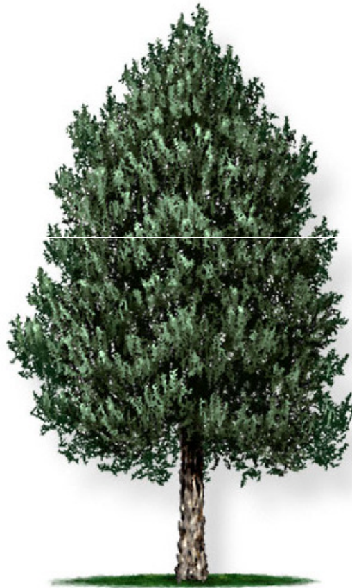
Arizona Cypress Cupressus arizonica