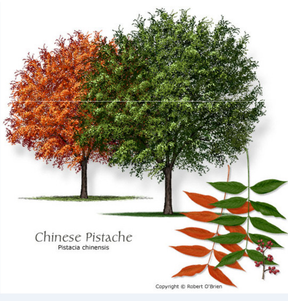
Chinese Pistache Pistacia chinensis