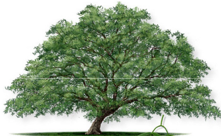
Honey Mesquite Prosopis glandulosa