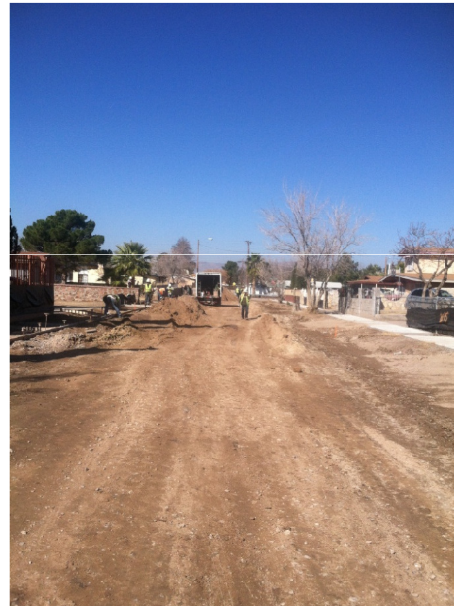
Demolition along Barker Rd. Complete