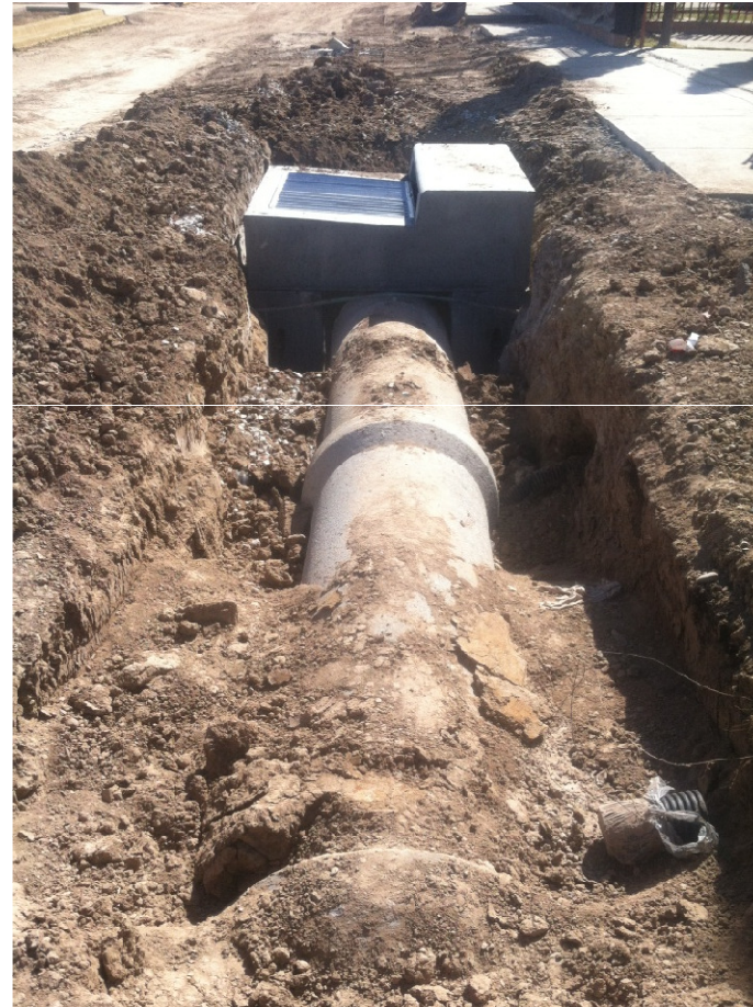
Installation of a new Storm Sewer Drainage System