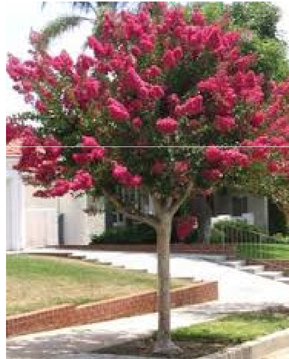
Installation of Crape Myrtle (Suitable for Narrow Parkways)