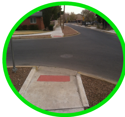
ADA Compliant Directional Curb Ramps