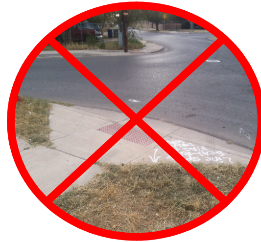
Diagonal Curb Ramps No Longer Desired