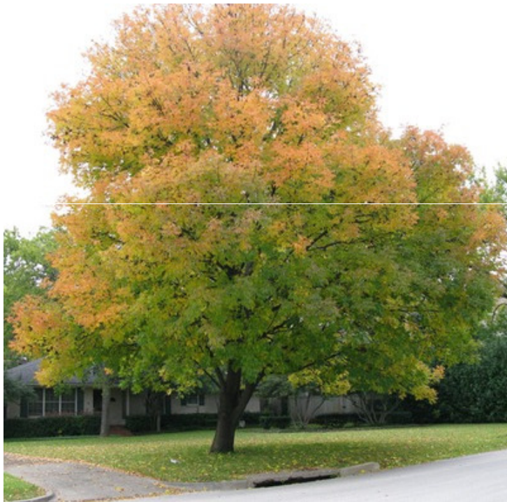
Installation of Texas ash