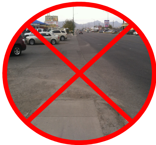
Non-Existing Curb Ramps