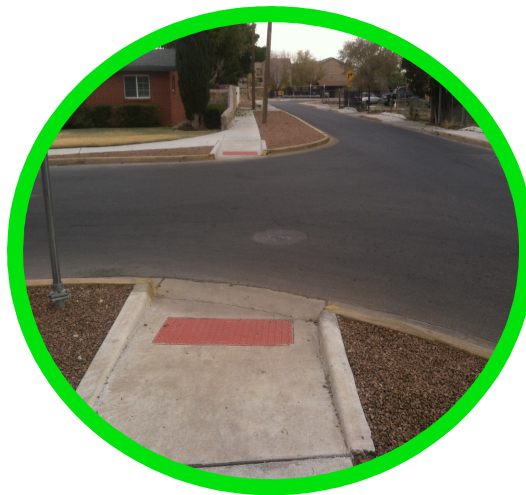
ADA Compliant Directional Curb Ramps