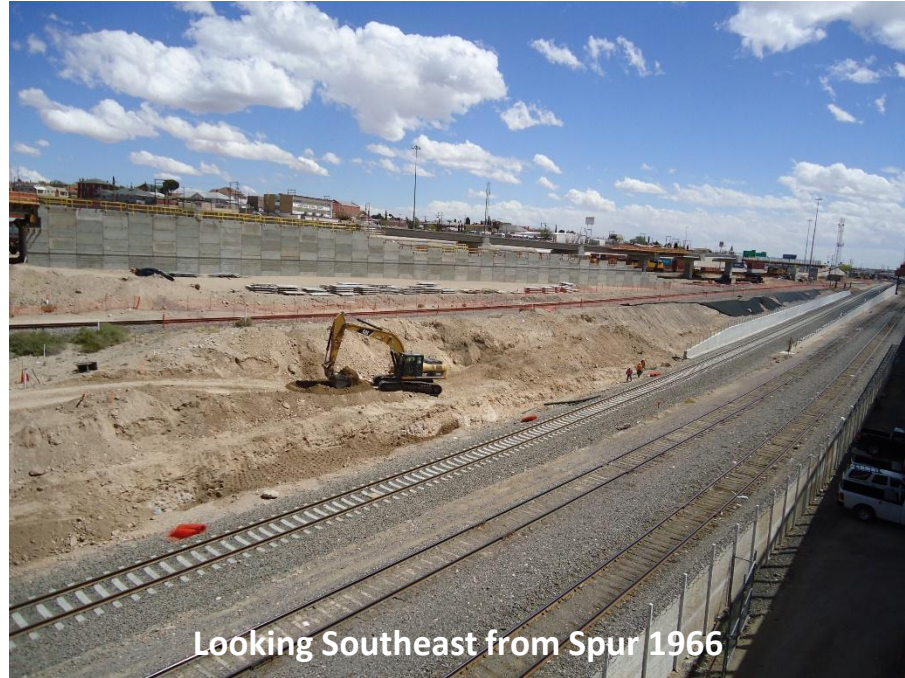
Looking Southeast from Spur 1966