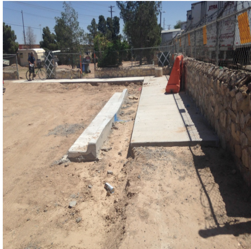
Utilities, curb and gutter