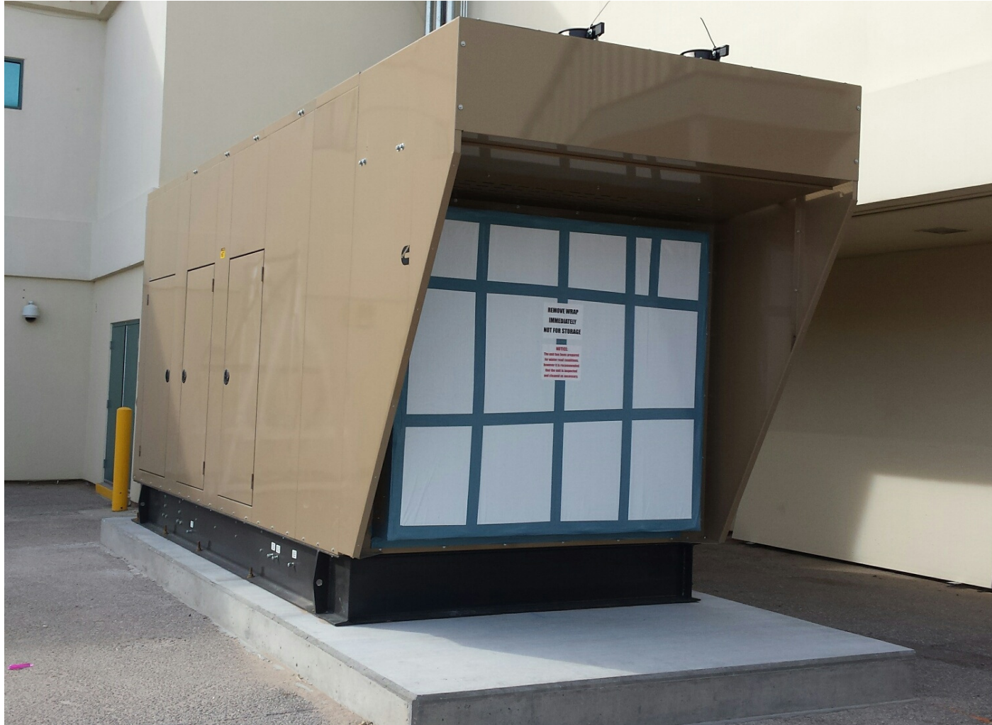
Generator 1 Installed