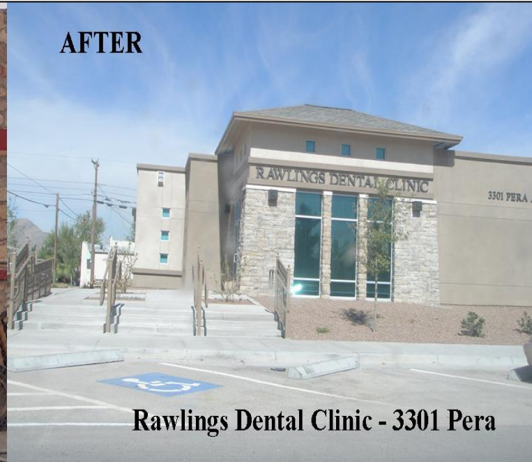
Rawlings Dental Clinic - 3301 Pera