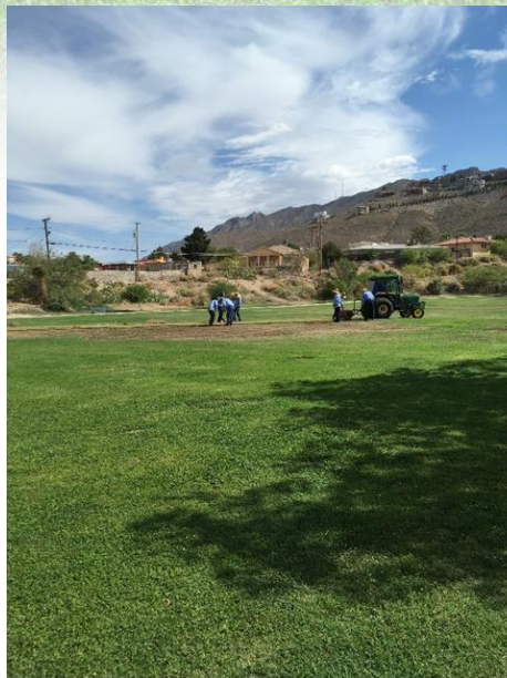
Alethea - Before