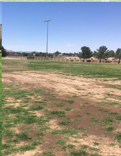
Pico Norte - Before