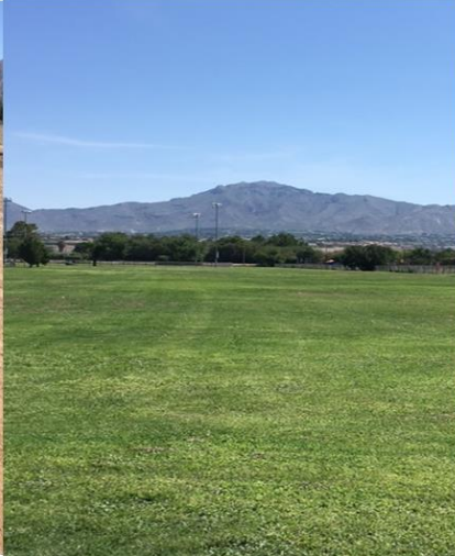
Braden Aboud - After