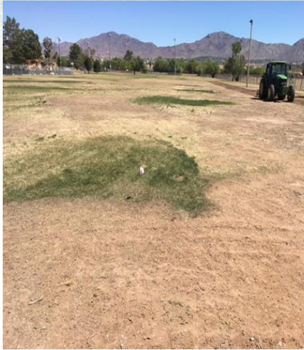
Braden Aboud - Before