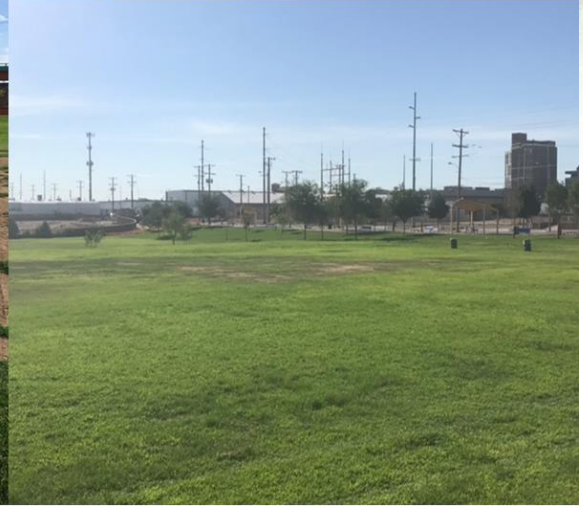
Saipan Ledo - After