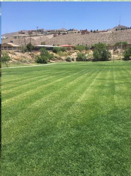
Alethea - After