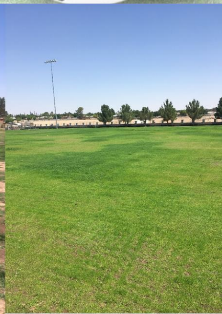
Pico Norte - After