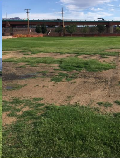
Saipan Ledo - Before