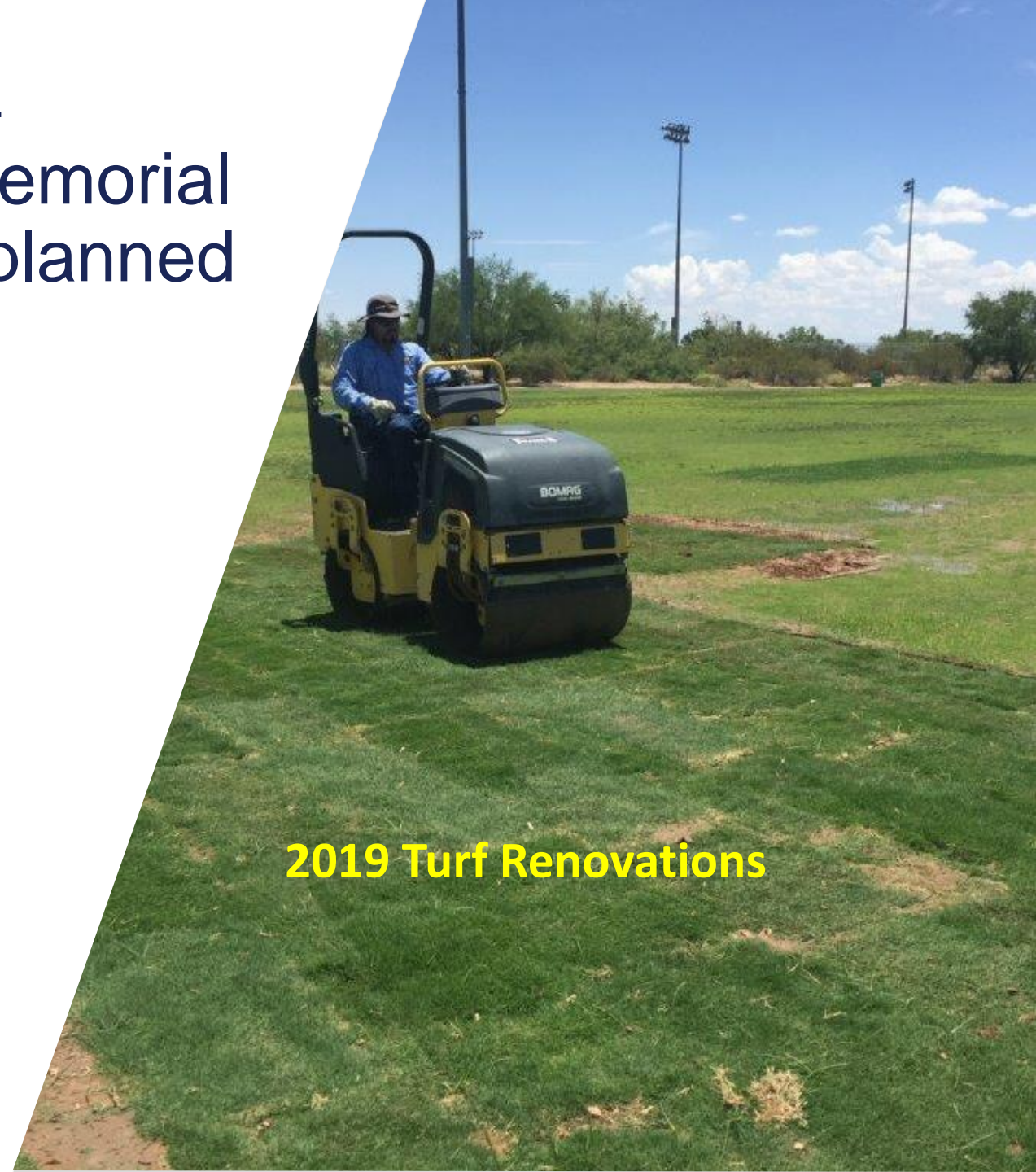
2019 Turf Renovations