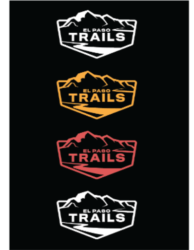
One color versions when used on dark background.