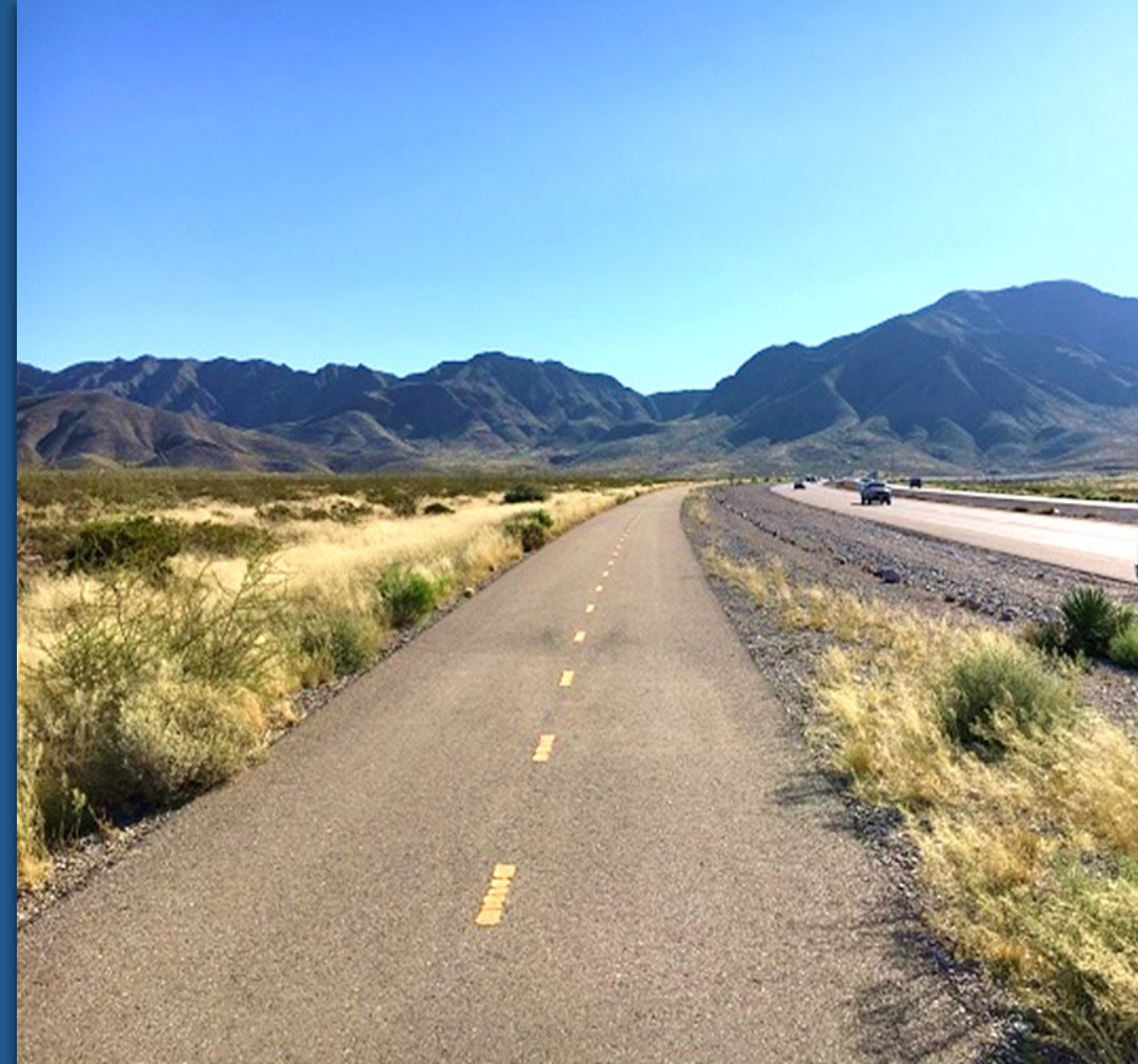
Existing paved trail along Transmountain Road