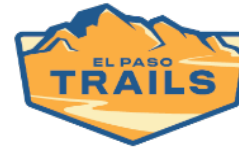
Full color logo.