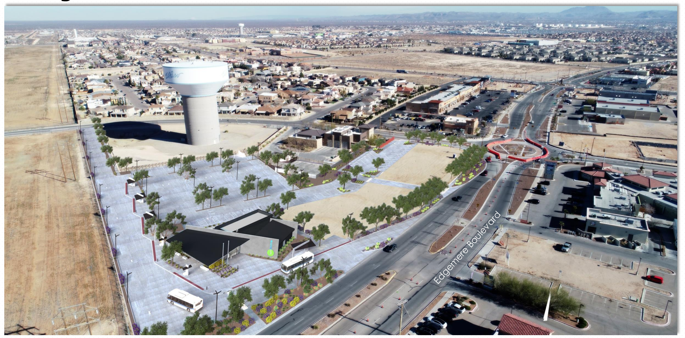
12781 Edgemere Boulevard