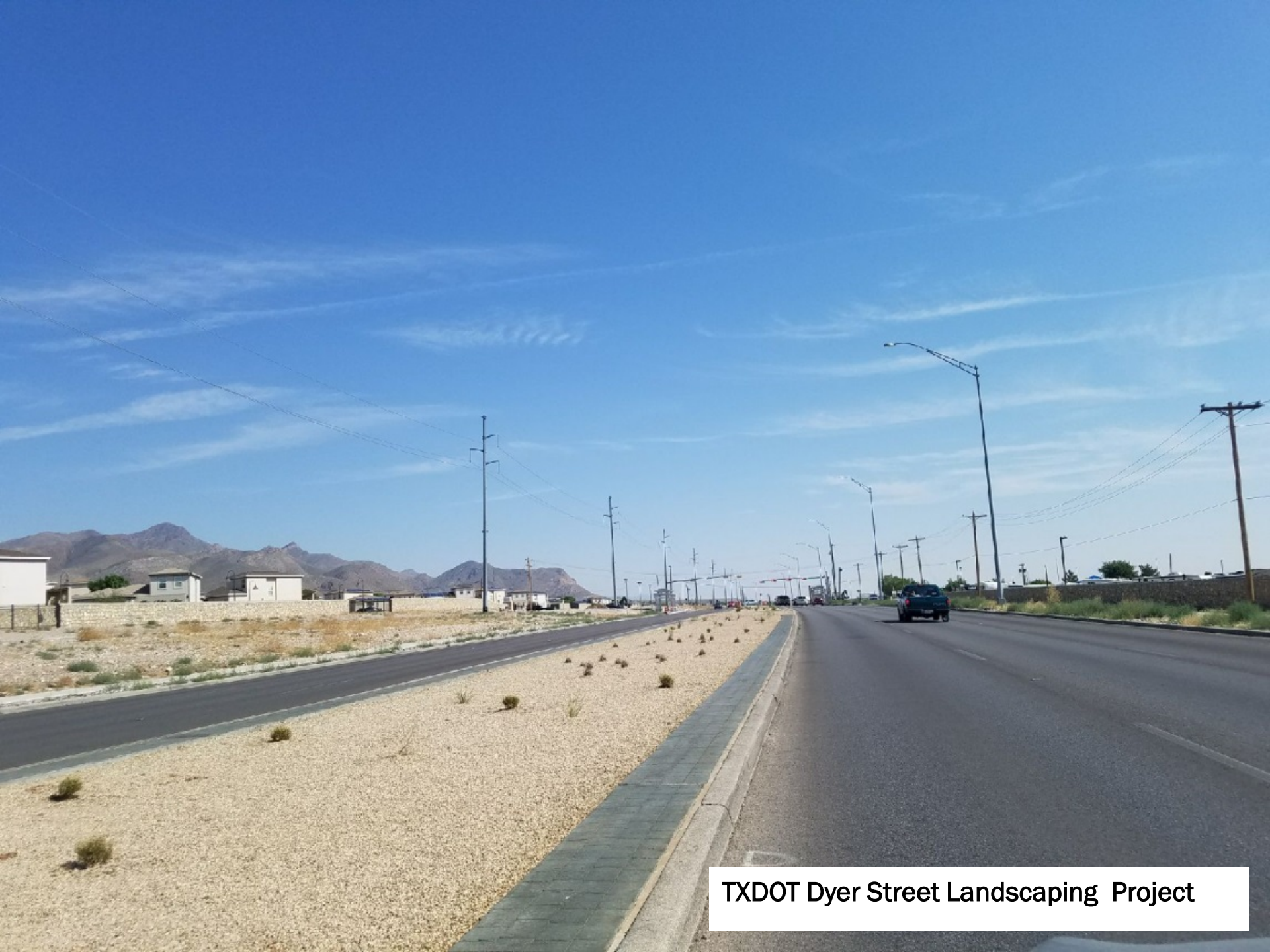
TXDOT Dyer Street Landscaping Project