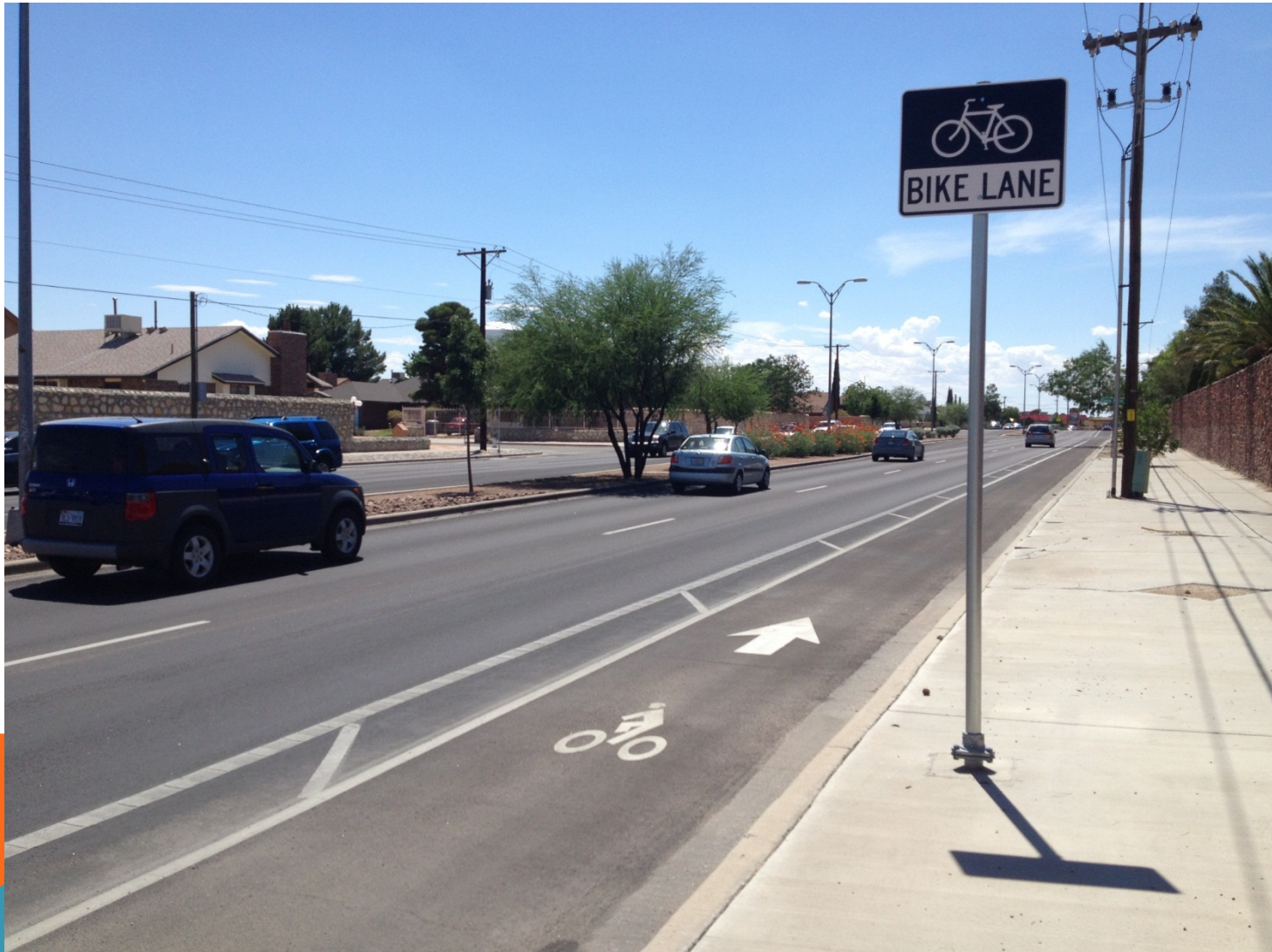
Montwood Bike Lane