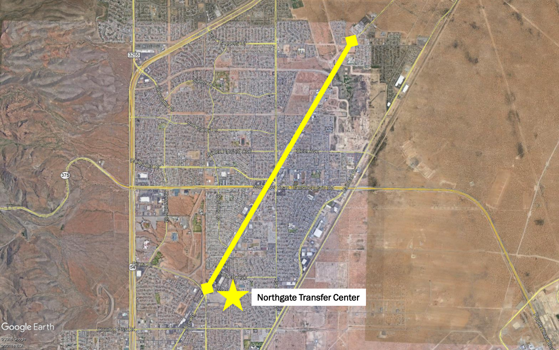
Dyer Street from Diana to Angora Loop – Phase 2