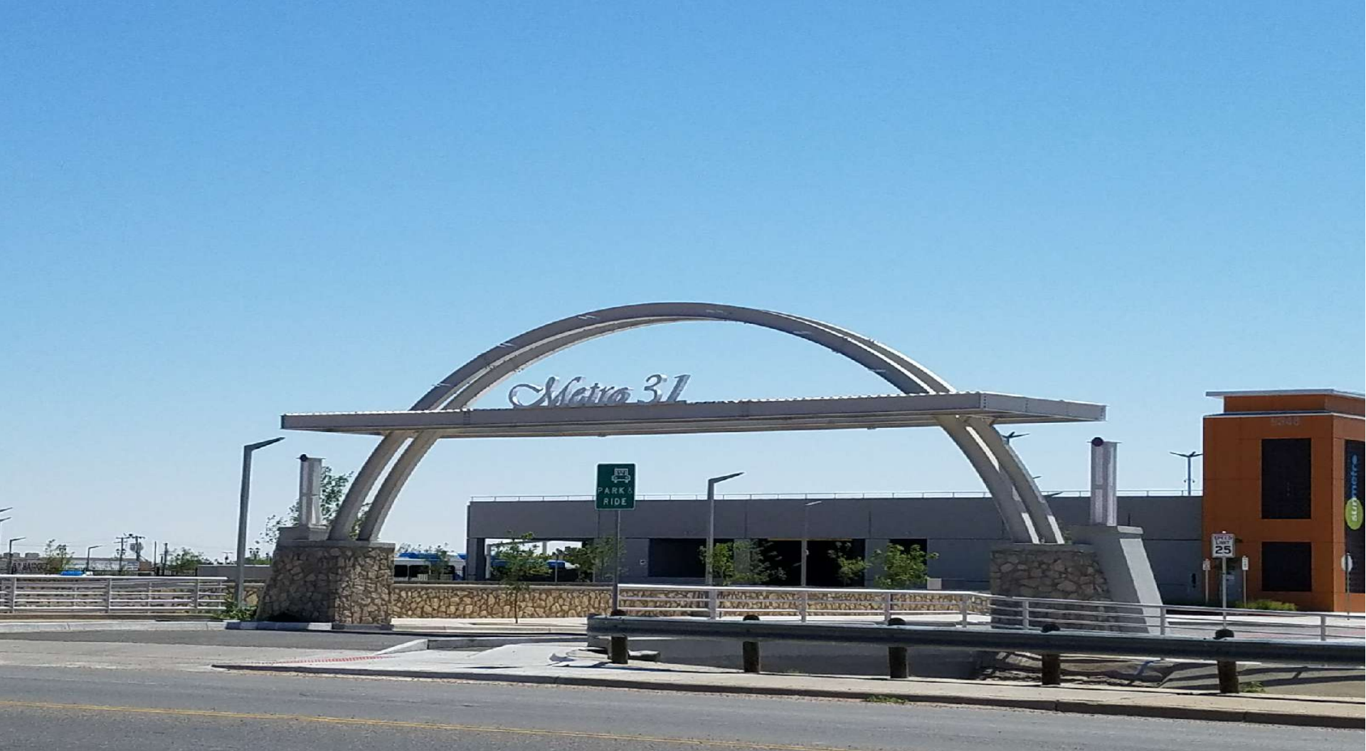
Metro 31 at Dyer & Diana