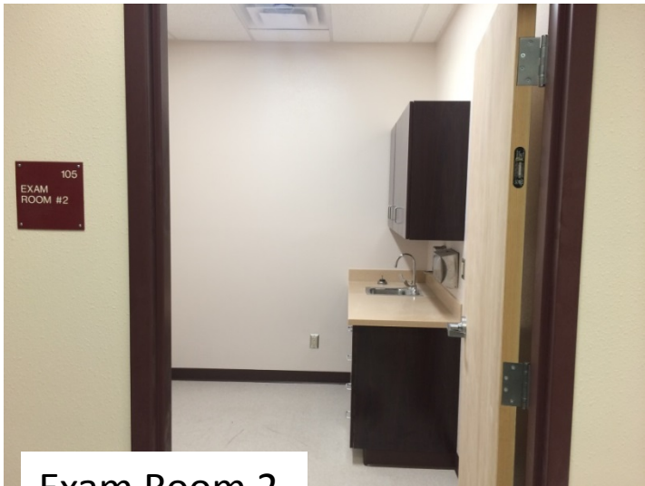
Exam Room 2