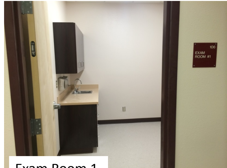
Exam Room 1