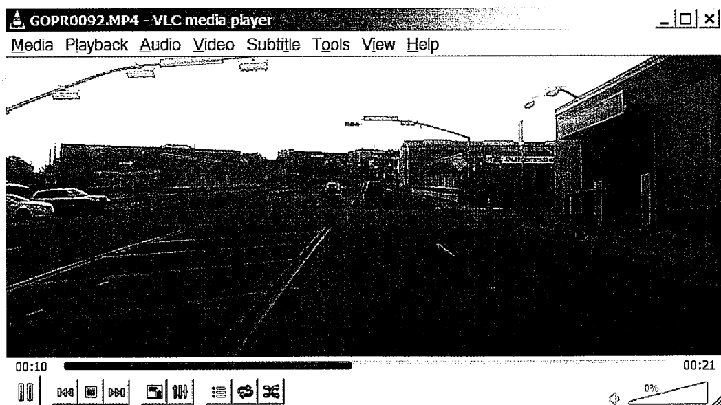
Figure 1. Northbound Santa Fe approaching Wyoming

Therefore, we recommend installation of the “No Turn On Red” sign for northbound Santa Fe traffic at Wyoming.