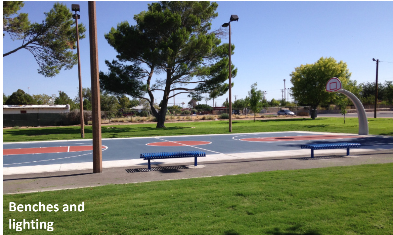
Benches and lighting