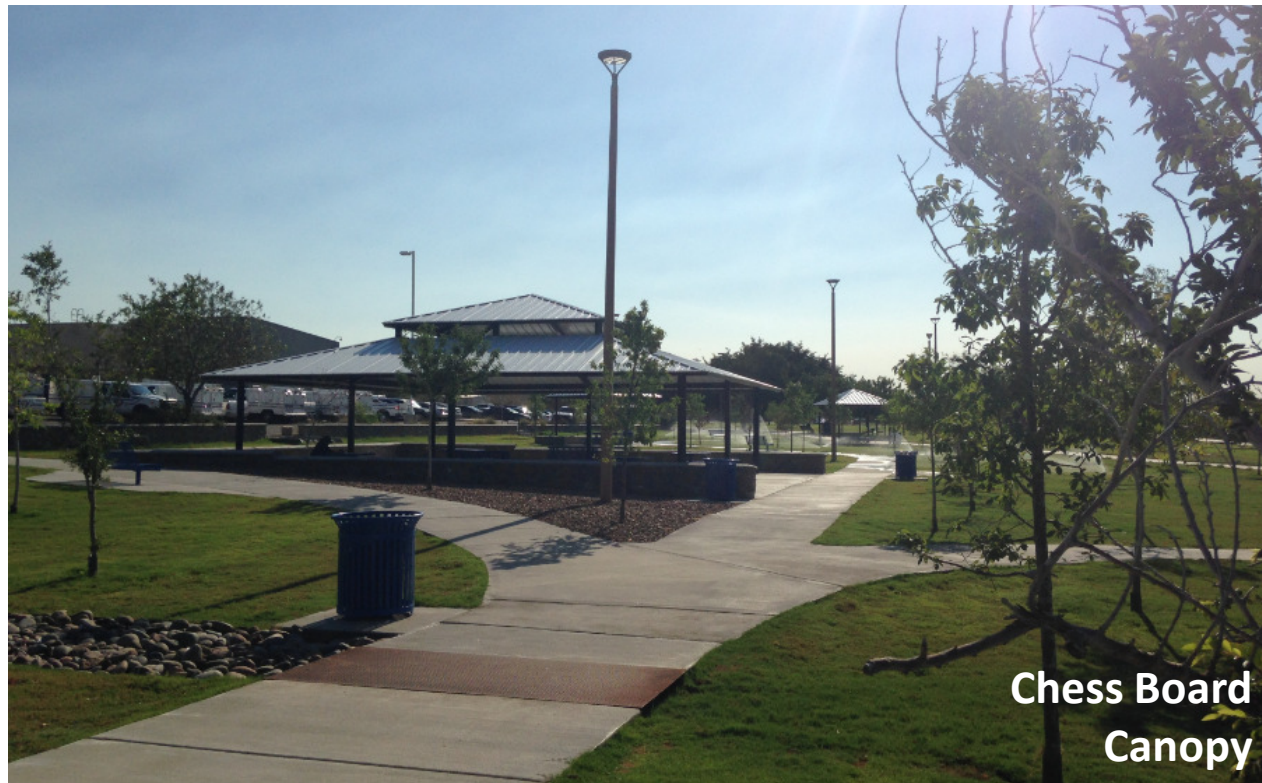
Chess Board Canopy