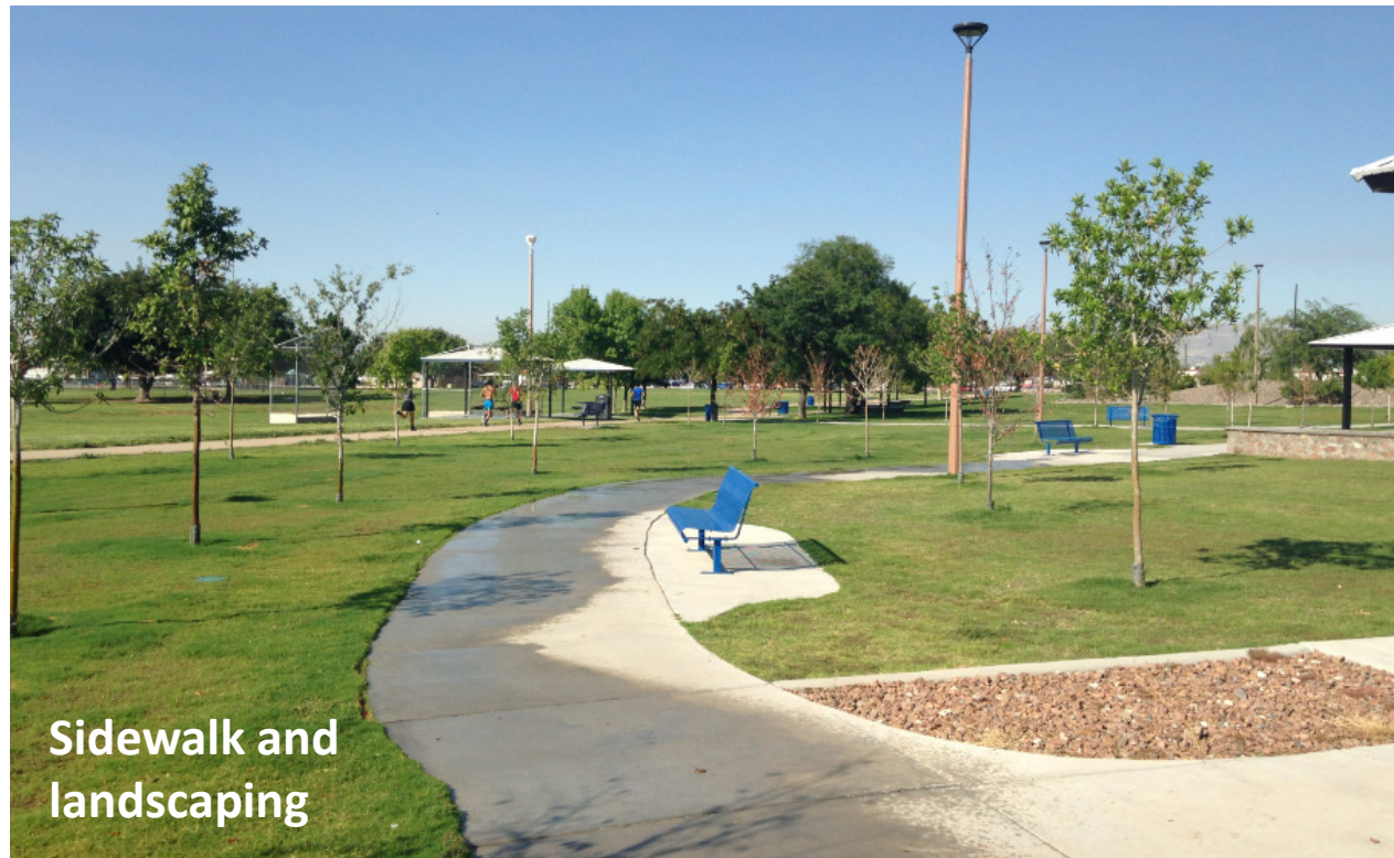
Sidewalk and landscaping