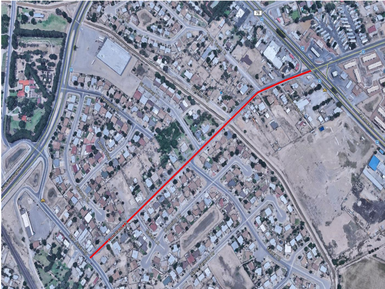
Lomaland from N. Loop to San Jose