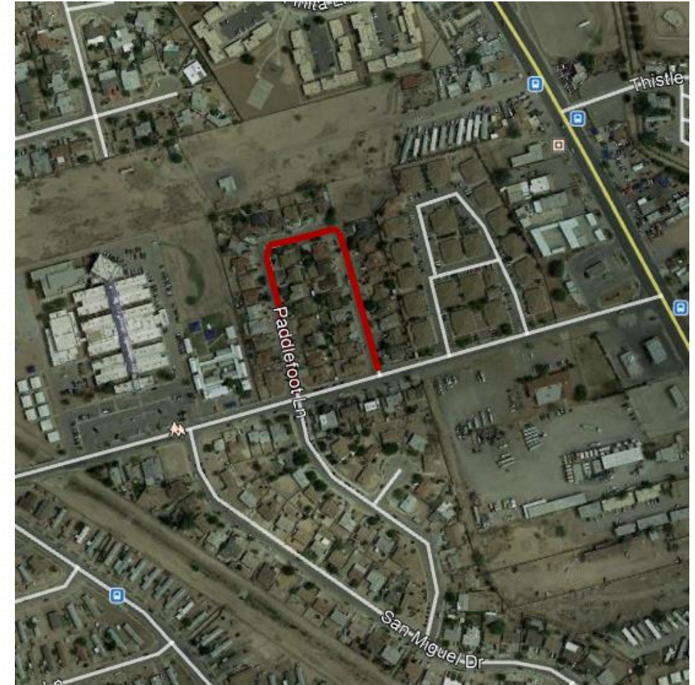
Paddlefoot from Prado to Prado