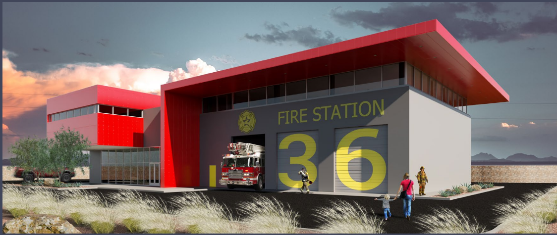
Architect's preliminary rendering. Actual project may vary.