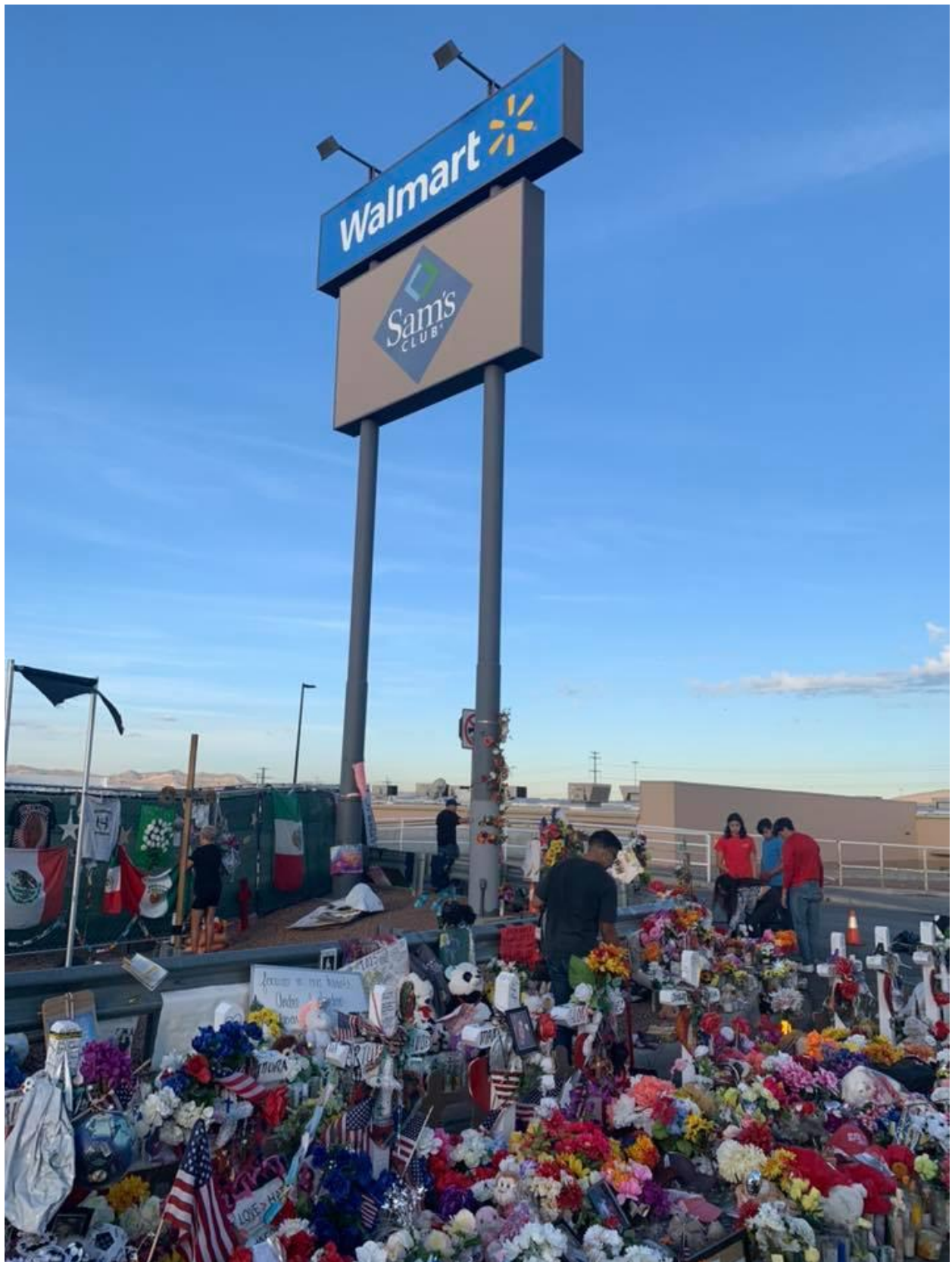
PHOTOS TAKEN DURING WEEKLY CLEAN-UP HOSTED BY REP. RIVERA + ZARAGOZA ROTARY CLUB