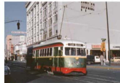
El Paso City Lines streetcar, 1908-1949

only the 3.2-mile long line into Juarez. In 1950, bought up PCC cars from San Diego to modernize the line. In 1975, a cross-border dispute with Mexican authorities brought a sudden, unexpected end to the international trolley, and the last cars ran to Juarez on July 31. The city of El Paso attempted to run a truncated local service with the PCC cars, but this experiment ended less than a year later. May 4, 1981, last day of operations on the El Paso local streetcar as long as.