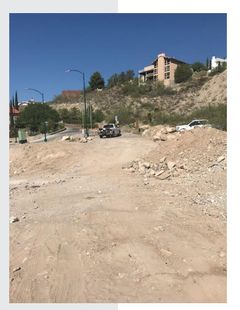
Pending cleanup north of the arroyo