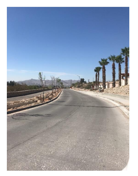
Pending shrubs, striping, signage, illumination