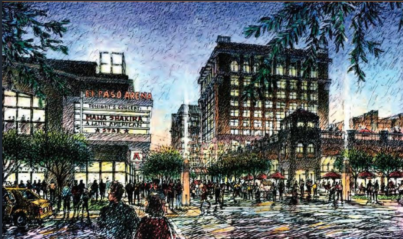
Artist rendering from 2015 Downtown Plan