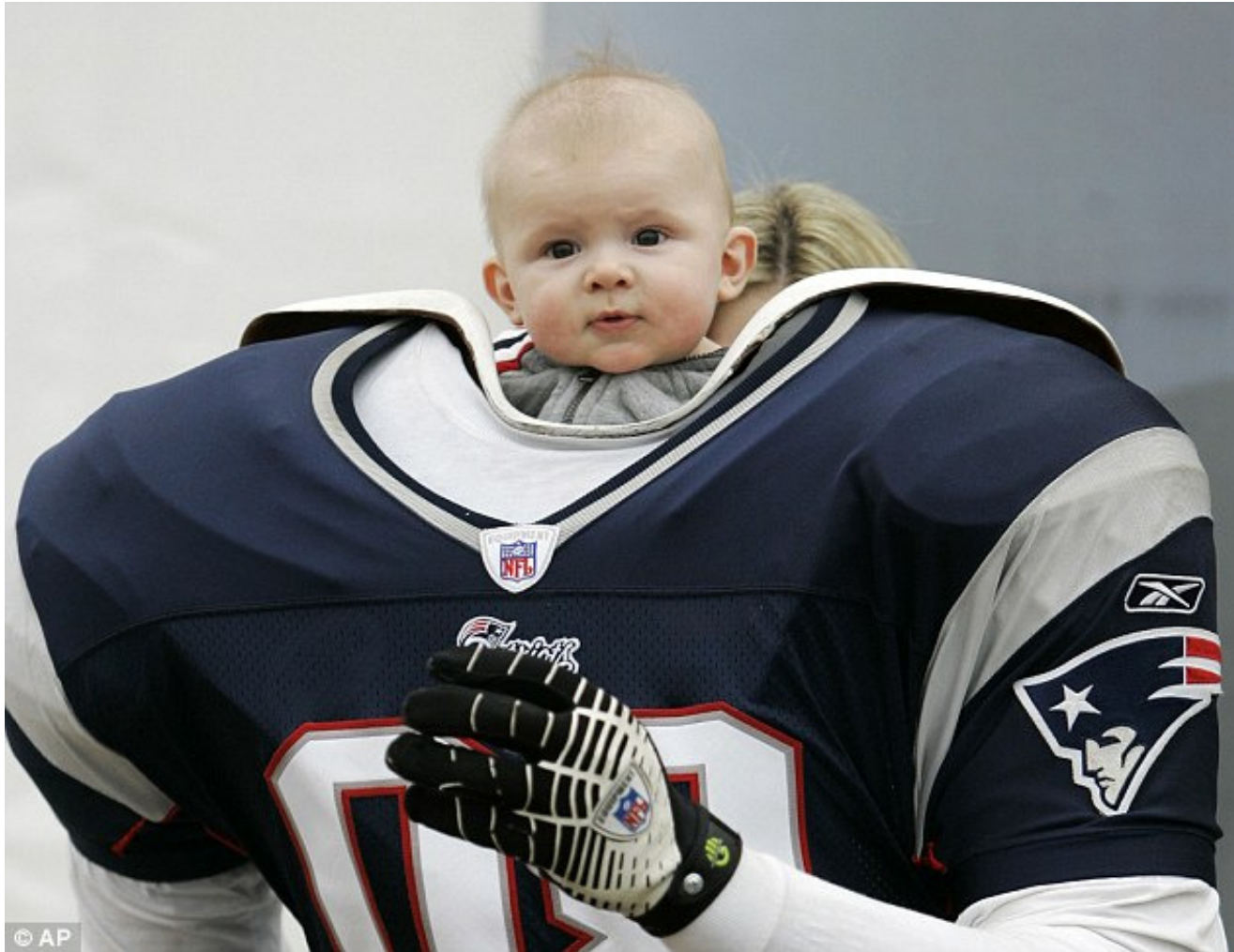
"Delivering Outstanding Services"