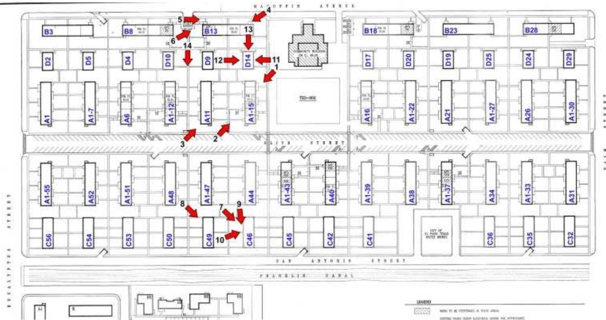
Figure 5 – Key Plan locations of exterior photographs, typical one and two story apartment buildings. Accessibility Alterations for Tays Complex – TX3-002 / TX3-003; sheet number C1R - Site Plan TX3-002 / TX3-003, dated March 1993, revised January 1995.