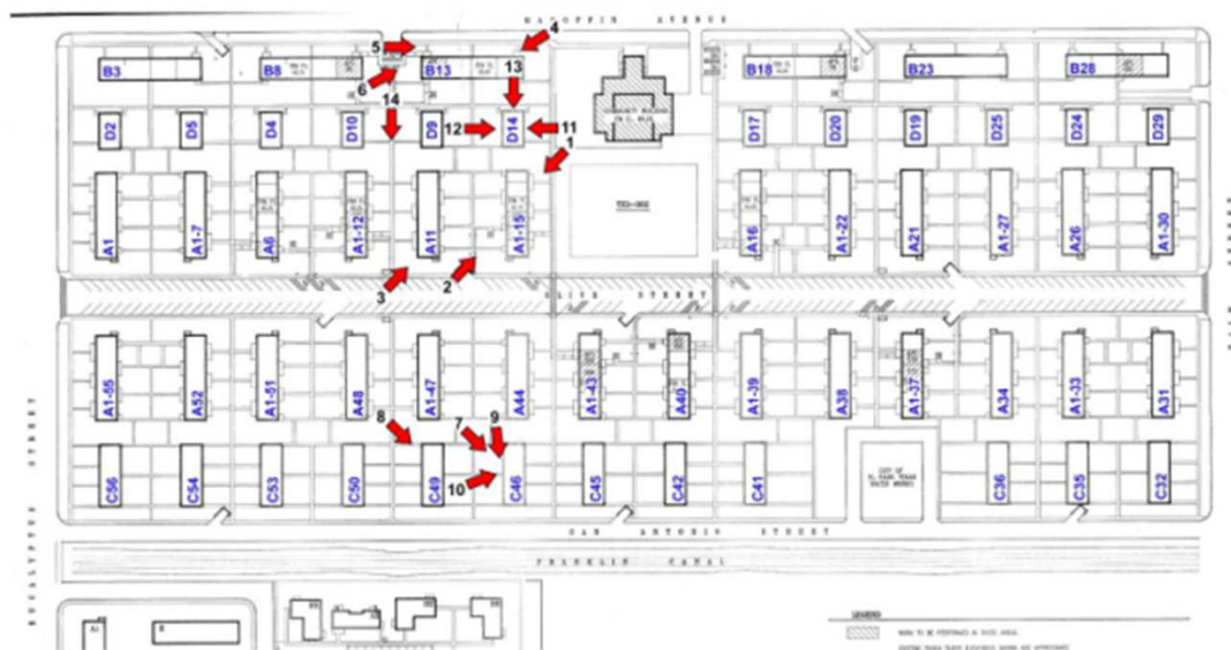
Figure 5 – Key Plan locations of exterior photographs, typical one and two story apartment buildings. Accessibility Alterations for Tays Complex – TX3-002 / TX3-003; sheet number C1R - Site Plan TX3-002 / TX3-003, dated March 1993, revised January 1995.