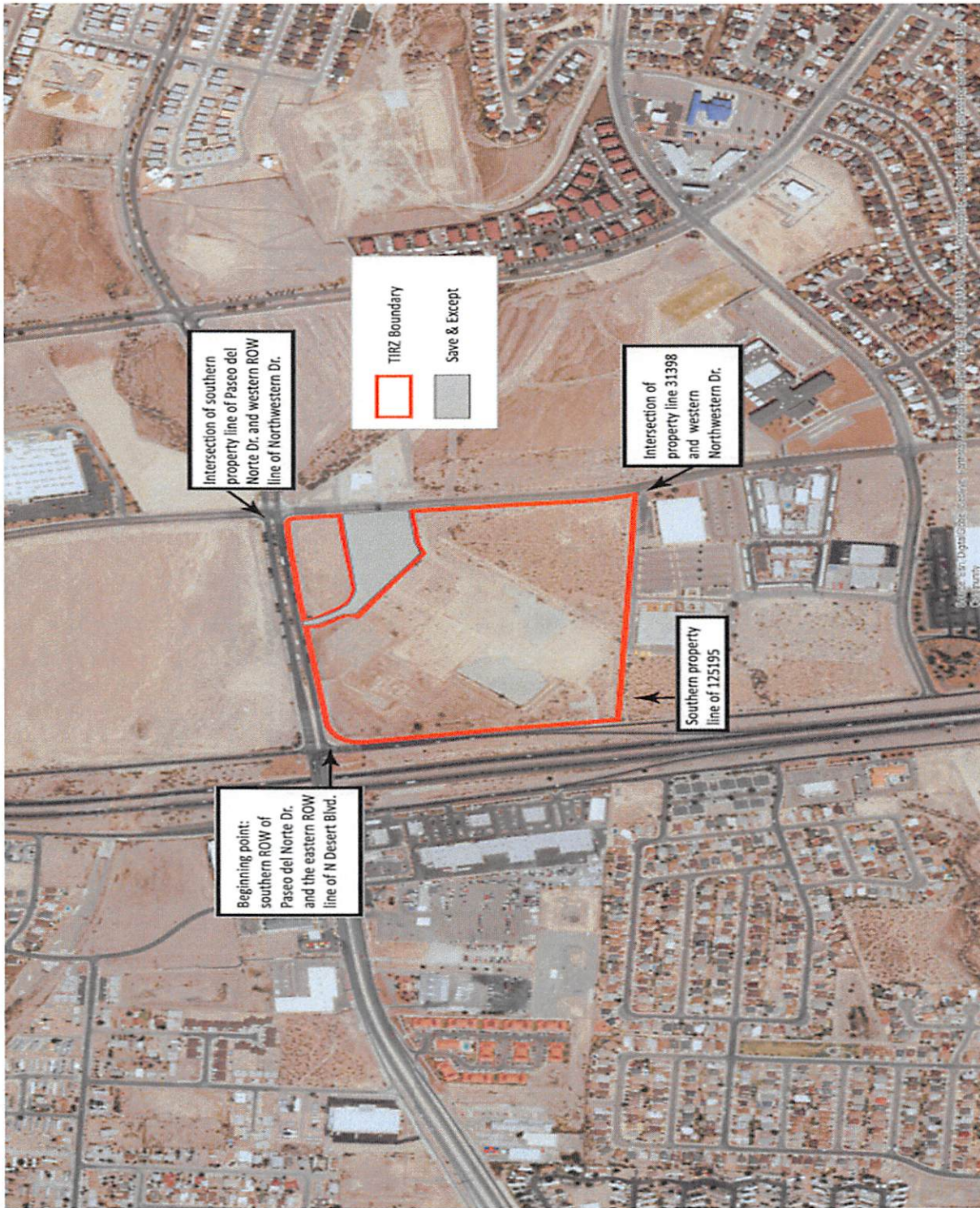
EXHIBIT "B" BOUNDARY MAP