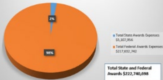
FY21 Awards Expended

FOR THE FISCAL YEAR ENDED AUGUST 31, 2021